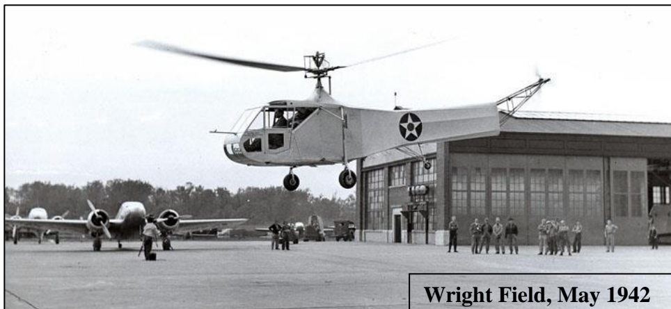
Wright Field, May 1942